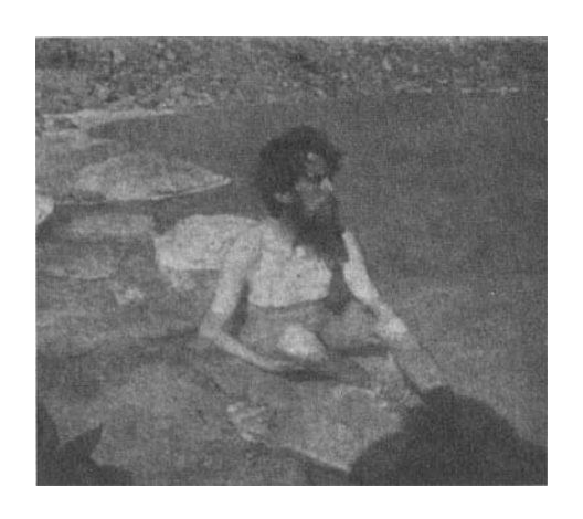
XAIPE \Sigma\Omega THP KO \Sigma MOY