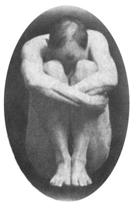
A GOOD POSITION FOR MEDITATION