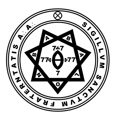
A∴A∴ publication in Class B